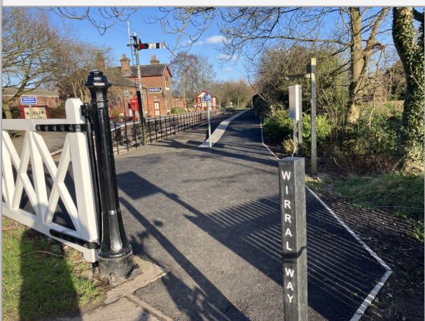
Resurfacing at Hadlow Road Station

Carried out by the Council, the improvements formed part of the recent 50th Anniversary of the Wirral Country Park.