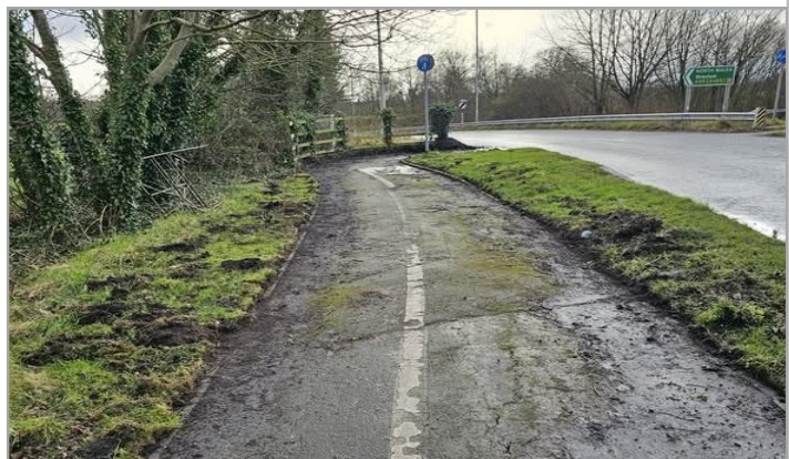
After - the full width revealed.

This is a segregated shared-use path, which means it has a path for cyclists and an adjacent one for pedestrians, separated by a solid white line. Over the years, vegetation had grown in from the sides, narrowing it so that it was not longer possible to see the separate paths, and making it very difficult for both cyclists and pedestrians.