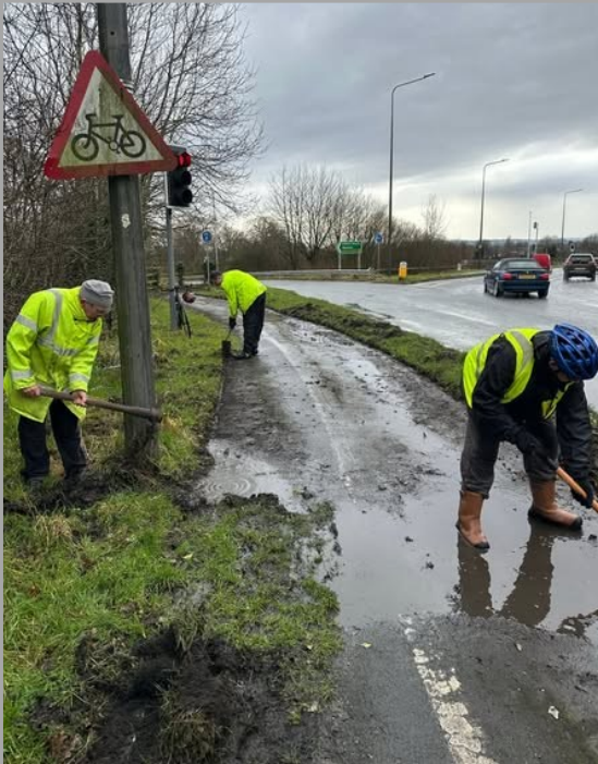
Hard at work. Note the several feet of overgrowth being removed.

On 19 th February, volunteers from Chester Cycling Campaign worked with the Council's "Your Streets" team to clear back the mud and overgrown vegetation, revealing the original width of the path. What a difference! You can see from the photos that several feet of overgrowth on either side were removed.