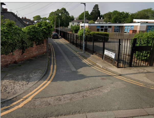
The Lightfoot Street end of Crawford's Walk

A favourite snicket in Chester is Crawfords walk in Hoole, just after the one way railway bridge on Westminster Road. It goes between Lightfoot Street (which is just off the Hoole branch of the Scarlet cycle route which runs from the city centre) and Hamilton Street and bypasses the busy Westminster road. Ding your bell at the jink in the Hamilton Street end!