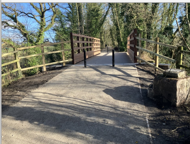
The new Windle bridge

The improvements, which are on the stretch from Hooton to Heath Lane, include: a new entrance at Hooton; the replacement of Windle bridge at Cuckoo Lane, Neston; resurfacing, using recycled road materials, and widening the path from 1.2 metres up to 3 metres in some areas.