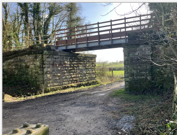
The new Windle bridge from underneath

Carried out by the Council, the improvements formed part of the recent 50th Anniversary of the Wirral Country Park.