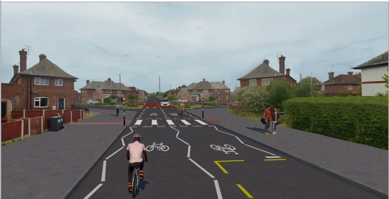
Image from the Council's Hawthorn Road / Poplar Place Traffic Management plan in Lache

We monitor the governments' and our local council's websites for consultations involving cycling or active travel, and always respond. We encourage the government and the council to seize opportunities for improvement and point out that people want to cycle, they just need it to be made easy.