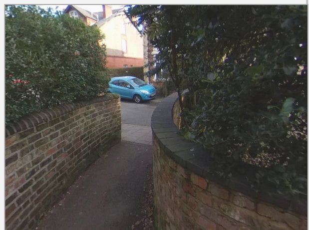
The Hamilton Street end of Crawford's Walk

Look out for more posts on snickets of Chester - coming soon!